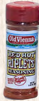
RED HOT RIPLETS SEASONING 7034656 • 6/27 OZ

345 S OLD HWY 141 FENTON, MO 63026 636.343.3050 OLDVIENNALLC.COM