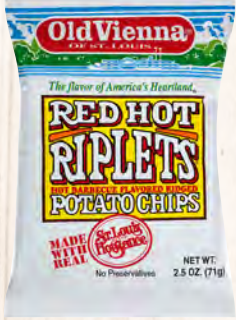
RED HOT POTATO CHIPS 7034300 • 12/10 OZ