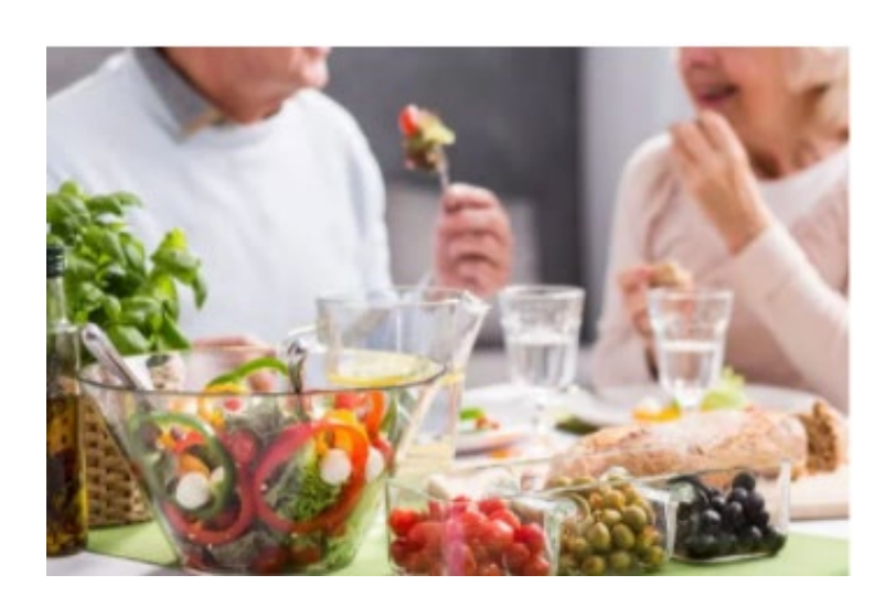
For more information about Canada's Food Guide click the link <u>here</u>