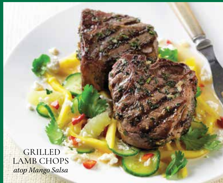
GRILLED LAMB CHOPS atop Mango Salsa