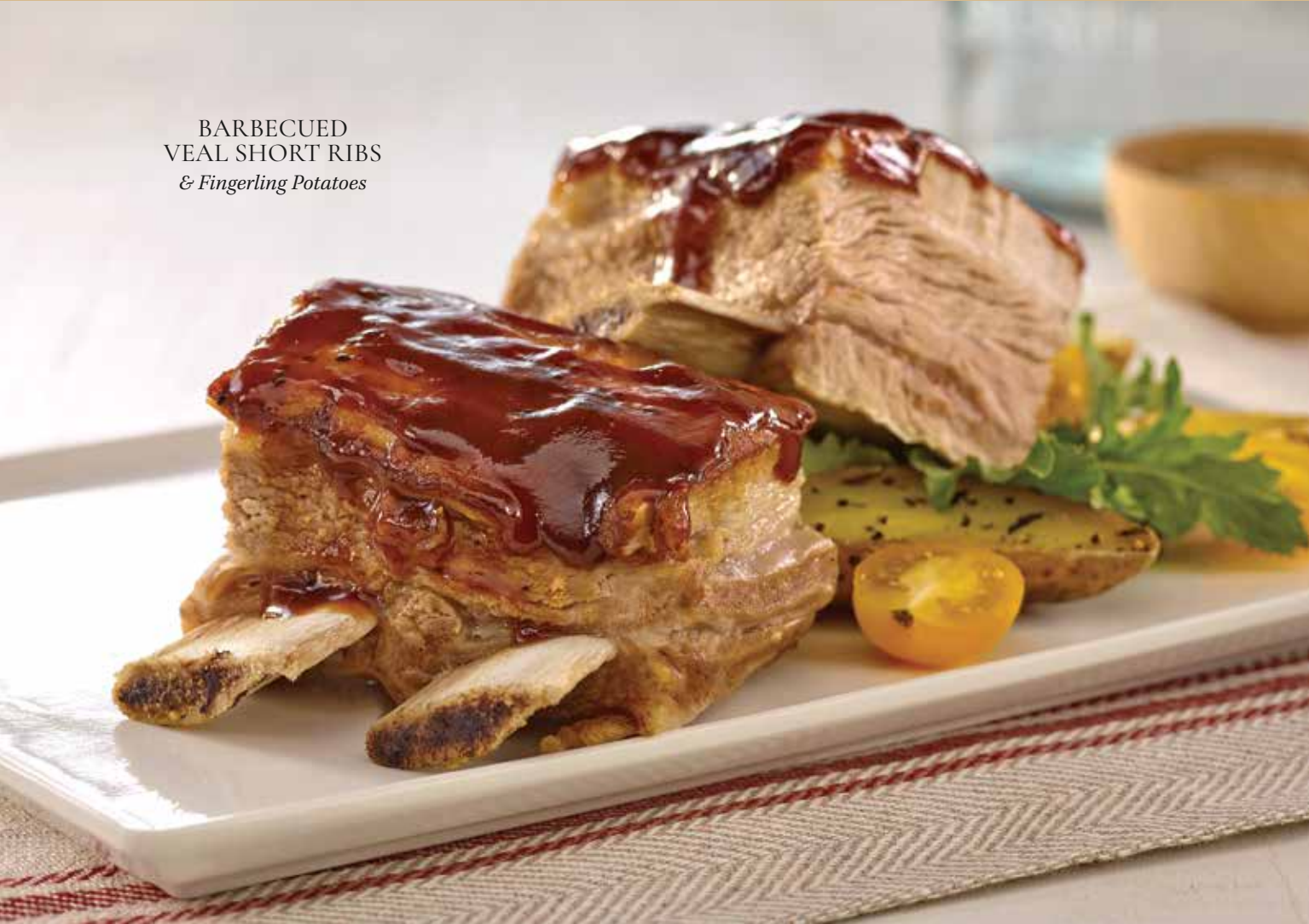
BARBECUED VEAL SHORT RIBS & Fingerling Potatoes